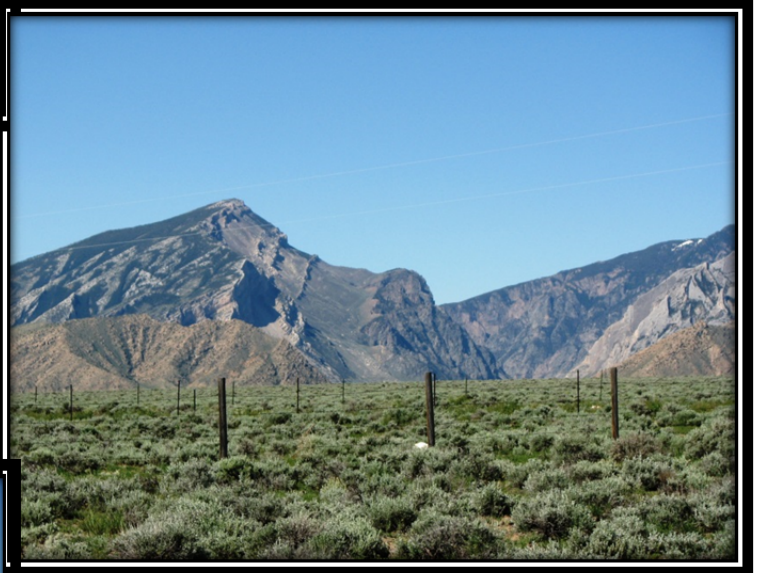
Clarks Fork Canyon