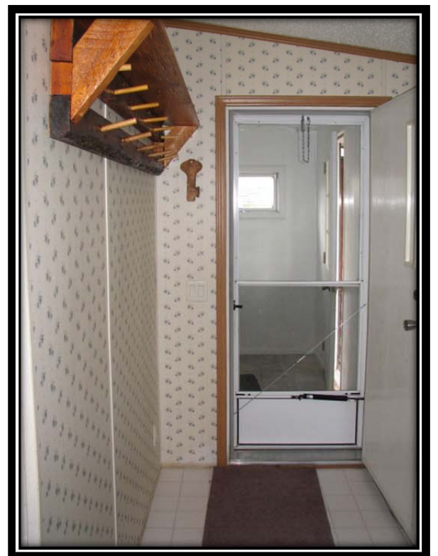
Mud Room/Back Porch