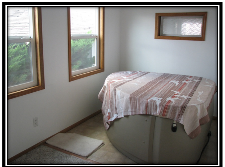
Hot Tub Room